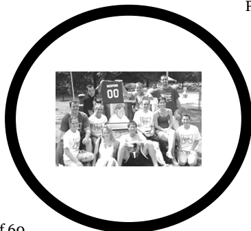
The Annual Medford Classic friends and family volunteers

We also hope to exceed our total of 20 blood products donated last year, touching the lives of 60 people! The Central Blood Bank will join efforts with the Annual Medford Classic and hold a blood drive at Kiwanis Park on July 23!